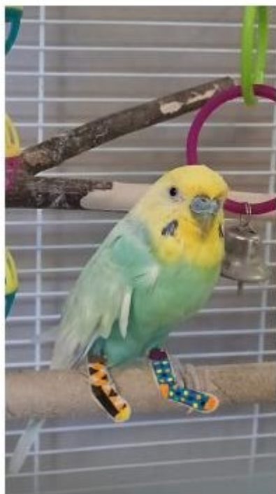
Louie's budgie Petel!